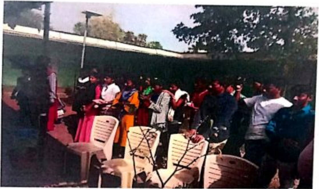
Glimpses of Field Study Tour at Swadhar Kendra, Budhoda 07/02/20