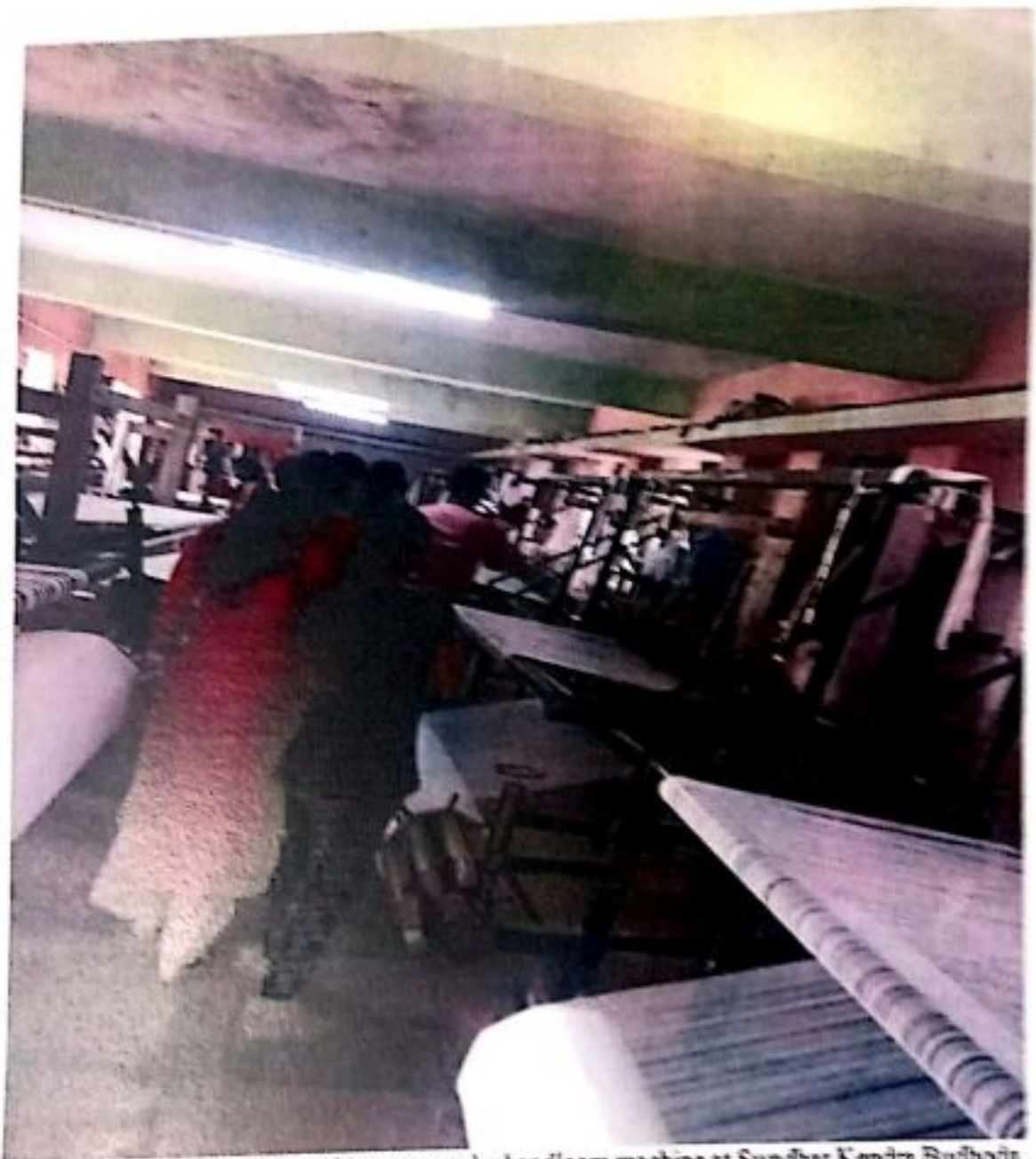
Students observing the cloth-making process by handloom machine at Swadhar Kendra Budsoda on 07/02/20